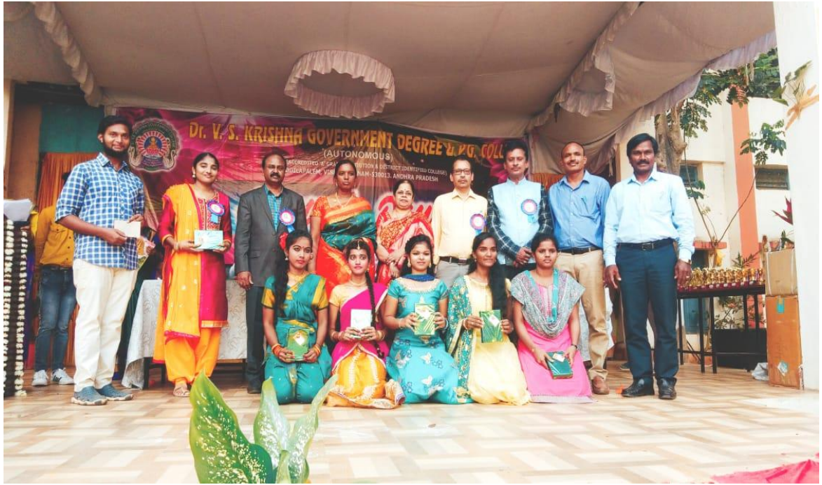
Awards received batch III BZC (EM) 2017-20